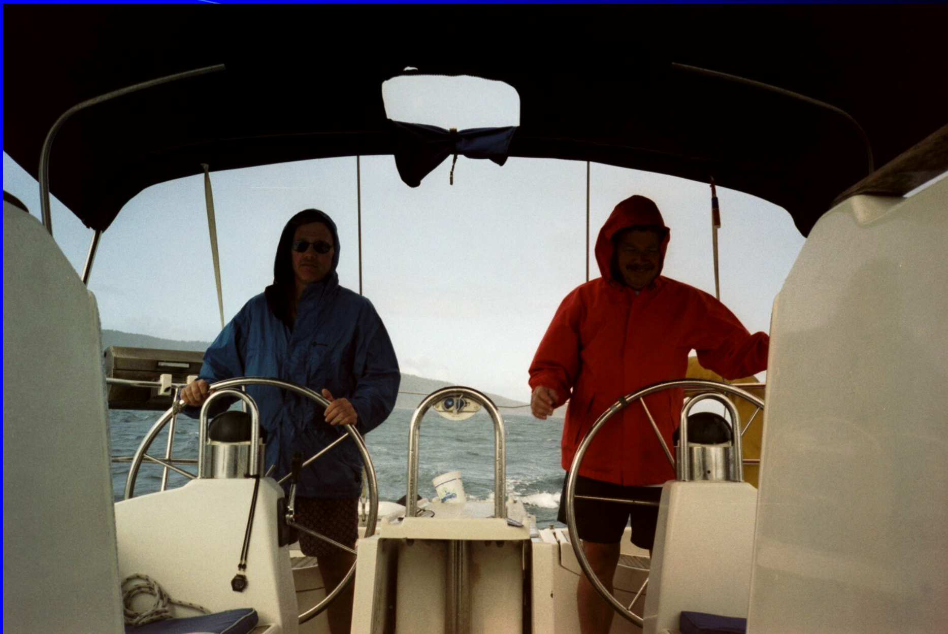
Rain Gear Practice