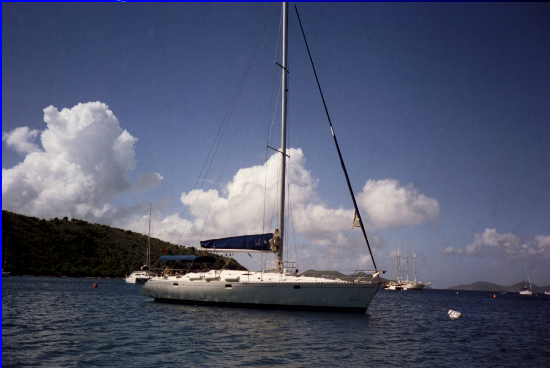
Just Audacious – Beneteau 510