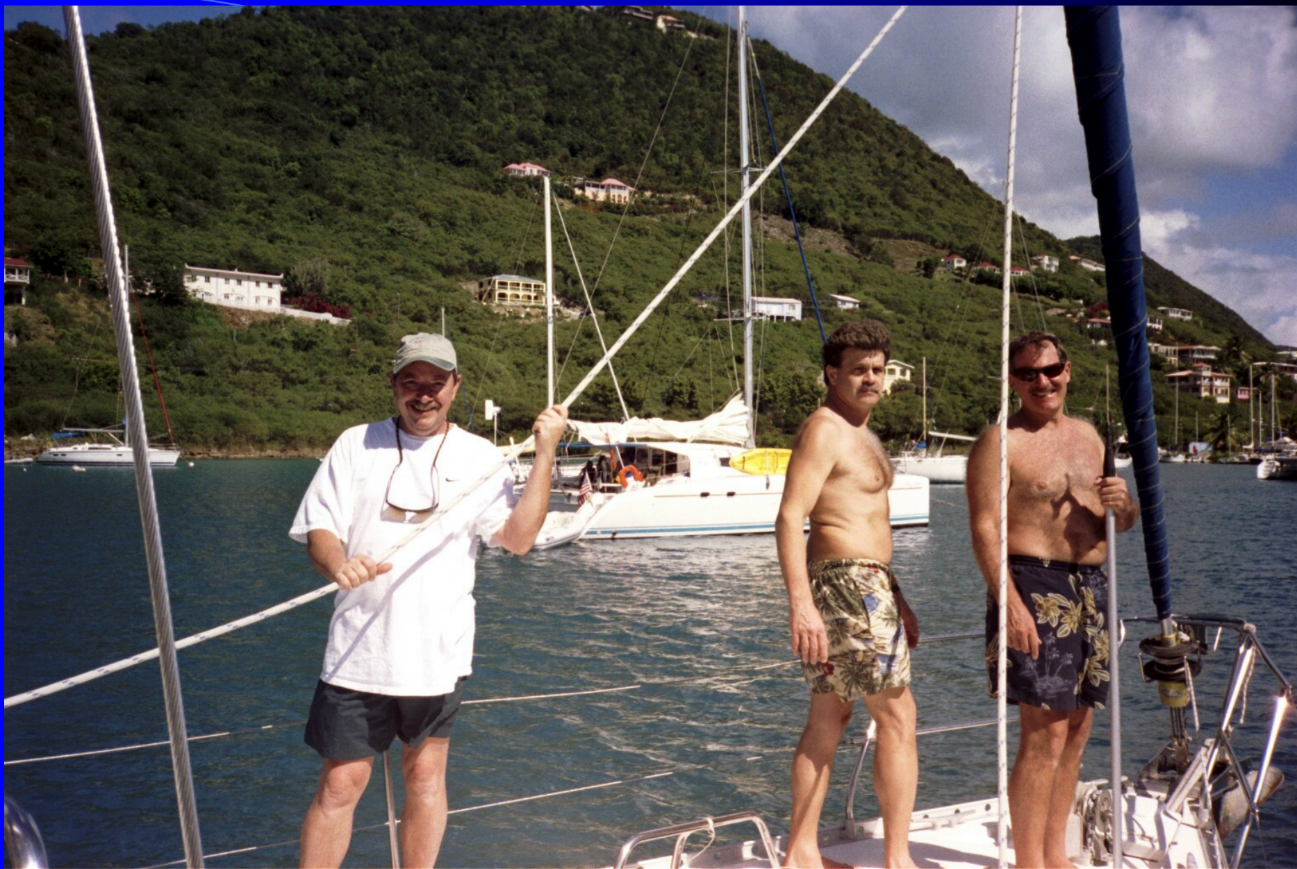
The boys of January!