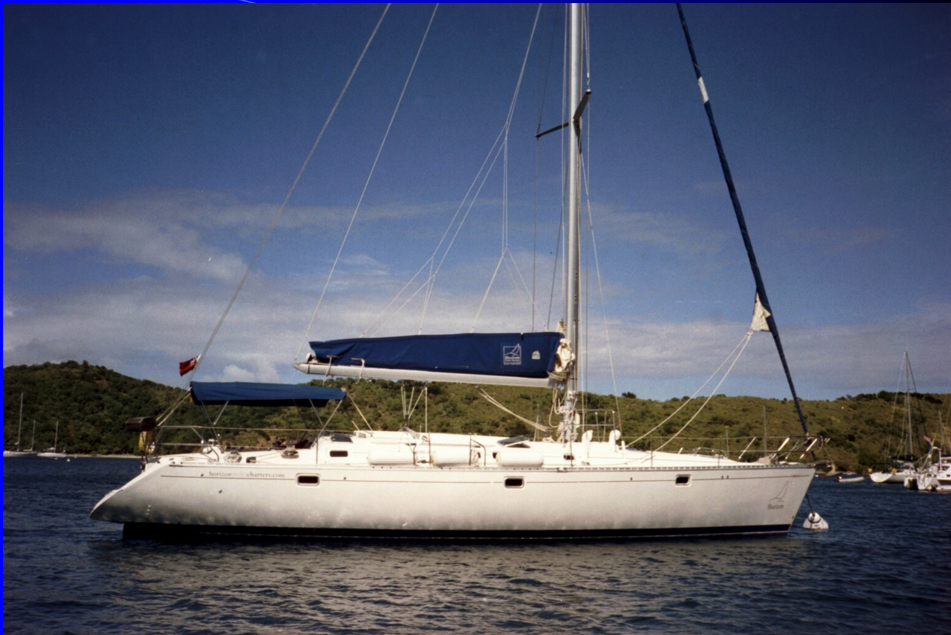
Just Audacious – Beneteau 510